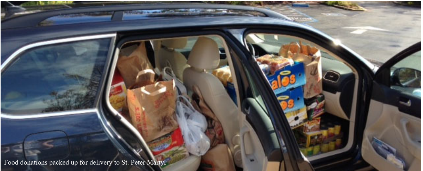
Food donations packed up for delivery to St. Peter Martyr